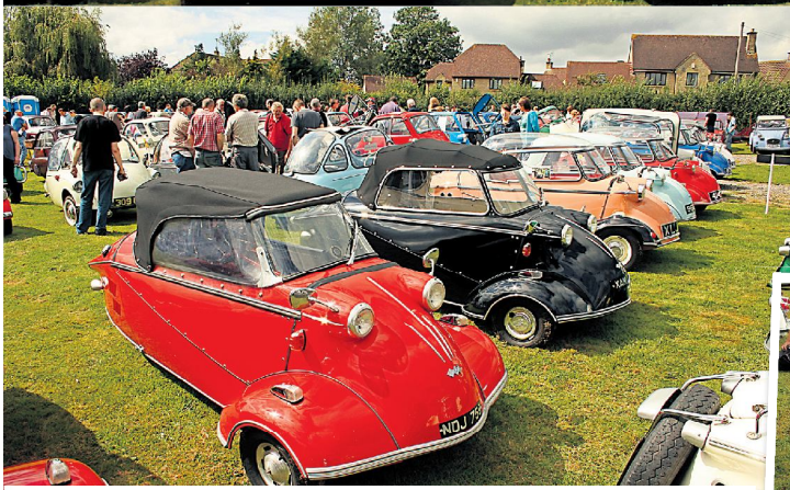
It's not often you get to see this number of FMRs all gathered together in one place