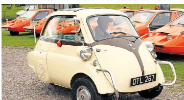
Isettas originally built by ISO in Italy (setta meaning little ISO) were in abundance at the rally