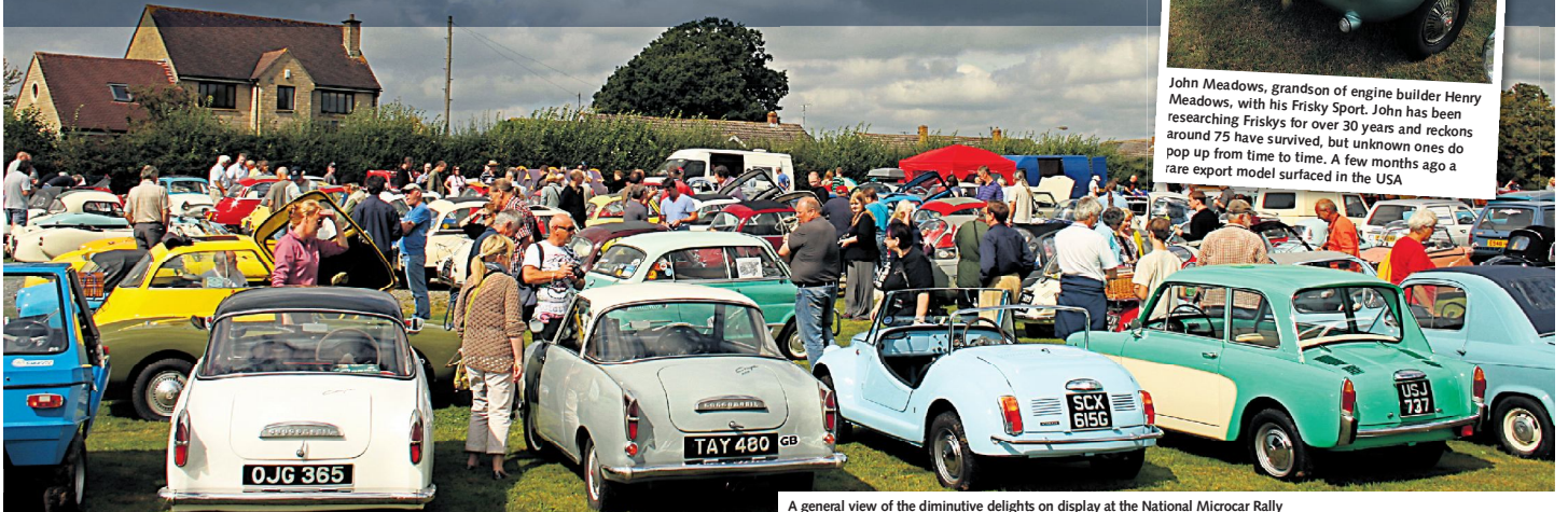
A general view of the diminutive delights on display at the National Microcar Rally