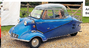
The Messerschmitt KR200 remains one of the most collectable of all microcars